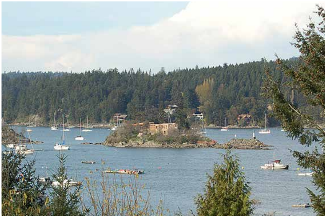
Grace Islet, B.C., 2014, includes a registered archaeological site and burial ground on which the property owner was allowed to begin construction of a home until stopped by protests by local First Nations and their allies.