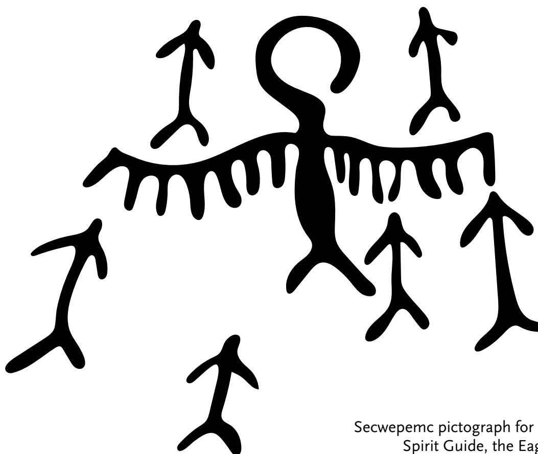
Secwepemc pictograph for the Family Spirit Guide, the Eagle.

Article 31.2. In conjunction with Indigenous peoples, States shall take effective measures to recognize and protect the exercise of these rights.