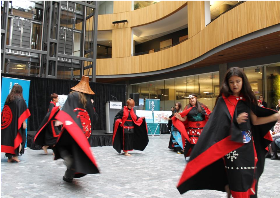
November 23, 2018: Dancers from the Nuxalk Nation perform at the unveiling of the Northern Sea Wolf artwork reveal event.